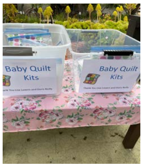
Baby Quilt Kits are available for volunteers to pick up.