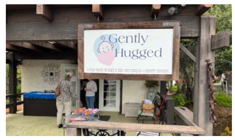
The Gently Hugged office and work site is located at the Rancho Bernardo Winery.

Gently Hugged washes, sorts, and packs an average of 60 to 80 large pink and blue bags of beautiful baby clothes and hand-made quilts each month, in sizes ranging from newborn up to 18 months old. Beautifully completed packages are distributed by nurses, social workers, and other professionals to low-income military, and disadvantaged families within San Diego County. Their distribution site list includes hospitals, north inland and north coastal health centers, Step Forward, UCSD, and Interfaith Community Services to name a few.