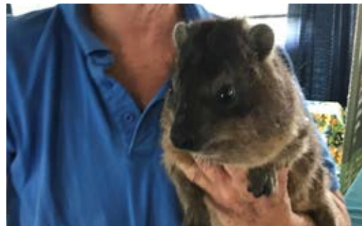
The friendly “Rock Hyrax” native to Africa