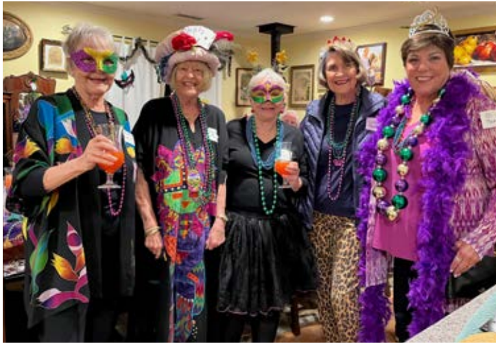
Beautiful ladies last year at the Mardi Gras Dinner