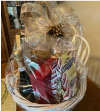
Buy tickets to win one of the special surprise GIFT BASKETS prepared by our Activity Groups and members. Only one Basket per winner.

SPARKLING JEWELRY, HOME-BAKED TREATS, BEAUTIFUL TREASURES, CRAFTS, BOOKS, PLANTS, and so much more!