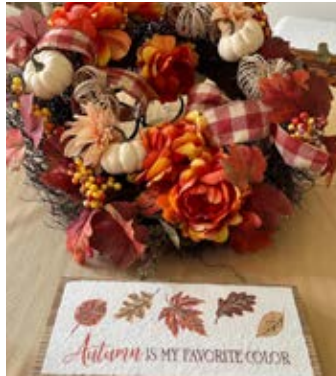
Buy tickets to win this beautiful FALL TABLE WREATH with $350 CASH INCLUDED.