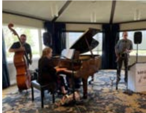
The Three-Piece High Society Jazz Band