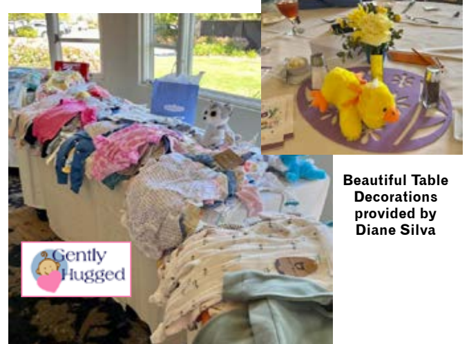
One of three tables full of baby gifts